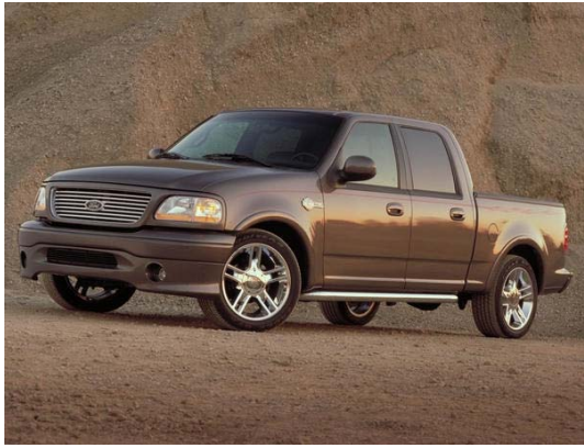
Figure 4. Harley Truck 2002

For 2003, everybody was quite excited to see what Ford and Harley would come out with to celebrate their 100 th anniversaries. The basic body style stayed the same as the previous two years, with the usual updates to the interior, seat stitching and colors, 100 th anniversary emblems, etc. The only change under the hood was painting the blower and plenum black instead of gray, and they also changed the lower valance with an updated shape. One of the biggest things that make the 2003's unique over any other year was the special 100 th anniversary pin striping that matched the pin striping on the 2003 Harley-Davidson motorcycles, with hundreds upon thousands of fine "Harley-Davidson" scripts holograms in a cross-hatch pattern down the entire pinstripe. They also revised the available colors in 2003 to have Black over Silver to match Harley's 100 th anniversary bikes, in addition to all Black, making a total of 10,047 trucks produced in 2003.