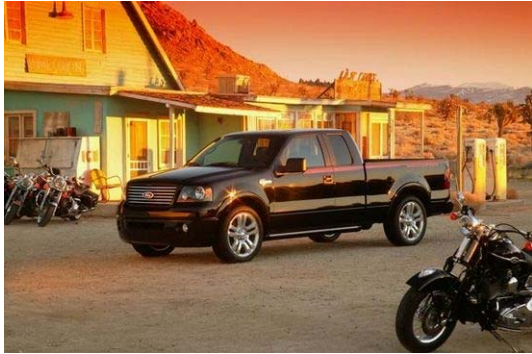
Figure 8. Harley Truck 2006

Orange with blue outlining, and the interior is all black leather with HD hydrographic logos on the trim pieces. The headlights are blacked out, nurf bars with chrome accents, chrome exhaust tips and billet style grille. The engine is the new 3-valve 5.4 liter naturally aspirated V8, putting out a respectable 300 hp. Just as in 2000, the 2006's offer another "first ever" for Ford when it comes to the rims. With 20's now being the every day norm, the 2006 Harley F-150 comes with massive 22" polished aluminum rims with Pirelli tires. Another first for the 2006, and any Ford Truck for that matter, is the optional All Wheel Drive, which is only available on the Harley Truck.