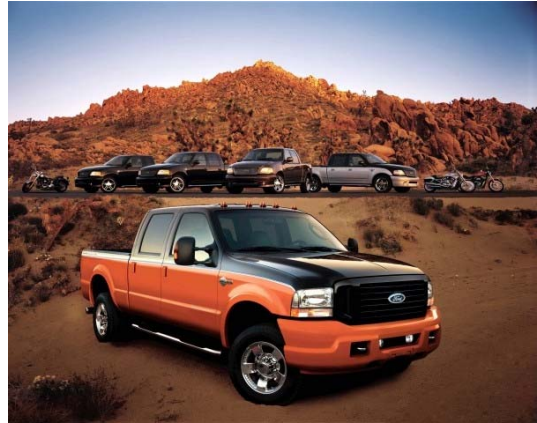
Figure 6. Harley Truck 2004

the rims were 18" polished aluminum, had the typical Harley Edition badges throughout the truck, nurf bars, exhaust tip, pinstripe, etc. One of the most unique factors about the 2004's was the paint options. In addition to trusty old Black, the 2004's could be ordered in Black over Dark Shadow Gray, or Black over Orange as well. Also, the 2004's could be ordered in crew cab or extended cab, F-250 or F-350, short bed or long bed, and with a 6.0 liter V8 Turbo Diesel, or a 6.8 liter V10 Triton. Out of all the years, the 2004's had the most available options to choose from, and all of them came in 4-wheel drive.