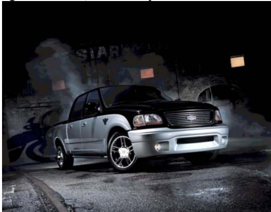
Figure 5. Harley Truck 2003

For 2003, everybody was quite excited to see what Ford and Harley would come out with to celebrate their 100 th anniversaries. The basic body style stayed the same as the previous two years, with the usual updates to the interior, seat stitching and colors, 100 th anniversary emblems, etc. The only change under the hood was painting the blower and plenum black instead of gray, and they also changed the lower valance with an updated shape. One of the biggest things that make the 2003's unique over any other year was the special 100 th anniversary pin striping that matched the pin striping on the 2003 Harley-Davidson motorcycles, with hundreds upon thousands of fine "Harley-Davidson" scripts holograms in a cross-hatch pattern down the entire pinstripe. They also revised the available colors in 2003 to have Black over Silver to match Harley's 100 th anniversary bikes, in addition to all Black, making a total of 10,047 trucks produced in 2003.