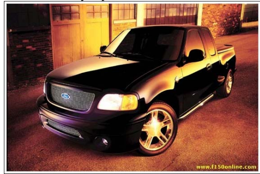
Figure 2. Harley Truck 2000

2000 HD Trucks were extended cab, flareside bed, with the 5.4 liter naturally aspirated V8.