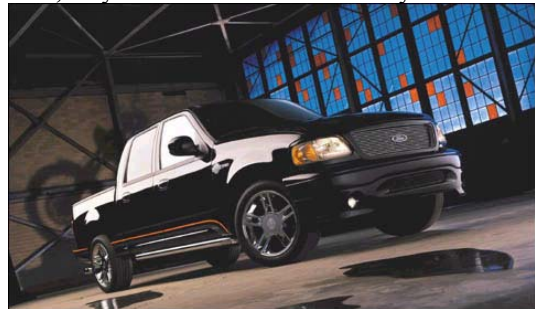
Figure 3. Harley Truck 2001

In 2001 Ford released the super crew body style, and it was only natural to have the Harley Edition F-150 in the new crew cab variation. As in 2000, the truck came in any color as long as it was black, and had the same basic exterior accents. The slight differences with the new year came mostly in the interior with new stitch patterns on the seats, and bucket seats front and rear. Also Harley wanted to change up the pinstripe in 2001, and moved it from a 3mm Harley-Orange stripe up top, to a 3 mm Harley-Orange stripe down along the rockers with a much larger gray pinstripe beneath it. 2001 is probably the most under-appreciated year Harley Truck to date, but with only 6,381 produced, they are one of the rarest Harley Trucks.